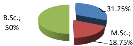
Figure 1. Experts from Work Sector.