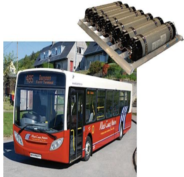
Figure 1. Application for Composite PVs in busses [5]

In the present article, the cylindrical composite pressure vessels specifically, type III and type IV will be mainly reviewed in terms of vessel composites architecture for different analysis methods i.e. FE simulation, mathematical and experimental approaches.